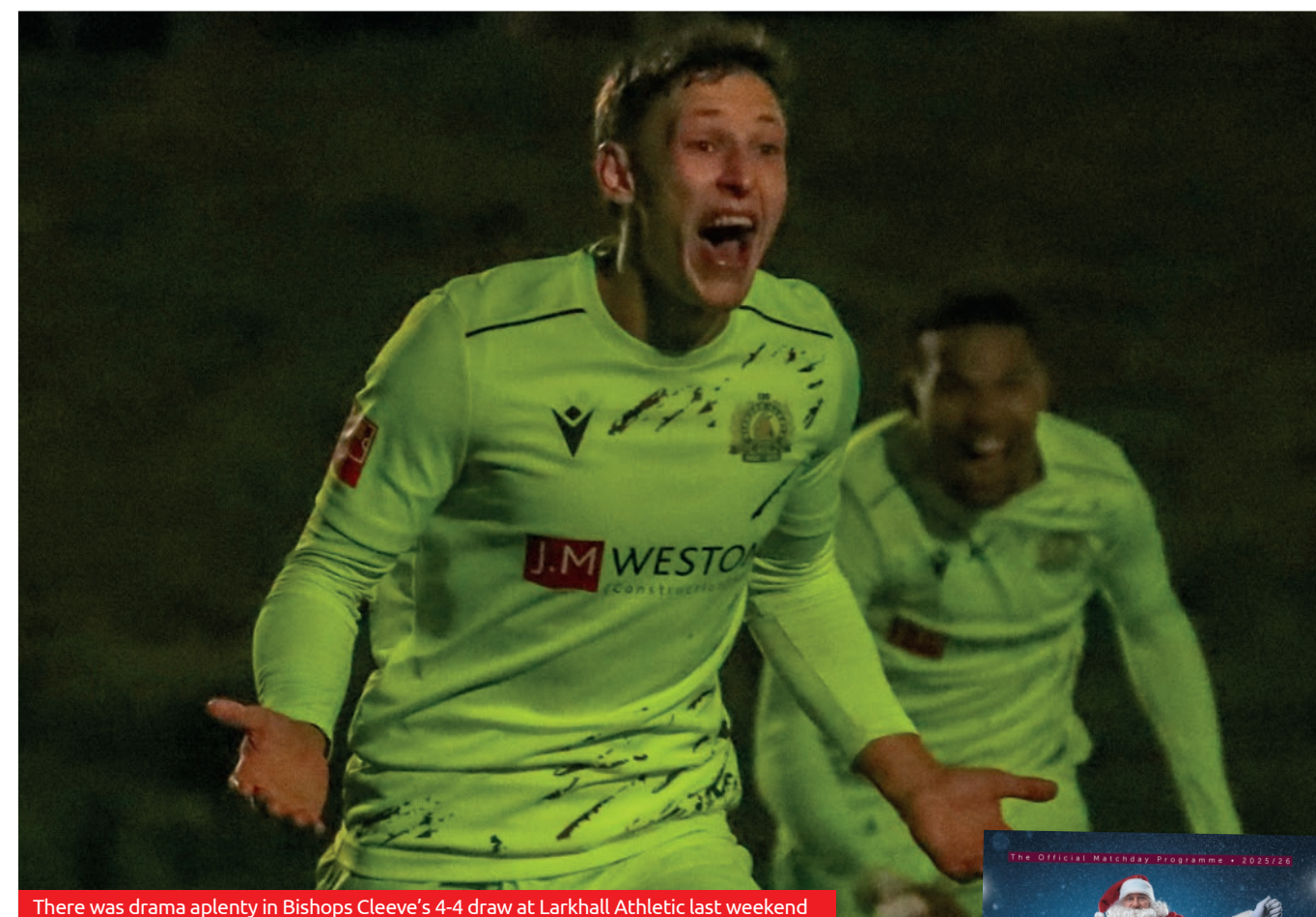
There was drama aplenty in Bishops Cleeve's 4-4 draw at Larkhall Athletic last weekend

With Christmas just around the corner, Frome Town lead the way and they head into their home encounter with Exmouth Town having come home from Tavistock AFC commanding 4-0 winners last time out. Second-place Portishead Town also picked up a 4-0 away triumph from their trip to Didcot Town as the top two march boldly forward. Portishead host Mousehole on Saturday.