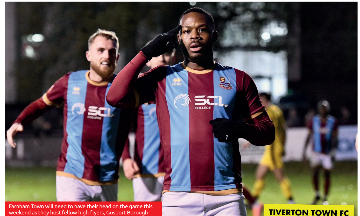
Farnham Town will need to have their head on the game this weekend as they host fellow high-flyers, Gosport Borough

The top two are both at home on this pre-Christmas weekend. Leaders, Walton & Hersham play host to Hanwell Town on the back of their Isuzu FA Trophy antics last weekend. They face opponents who are looking to pick themselves up after losing at home to Hungerford Town on Tuesday evening.