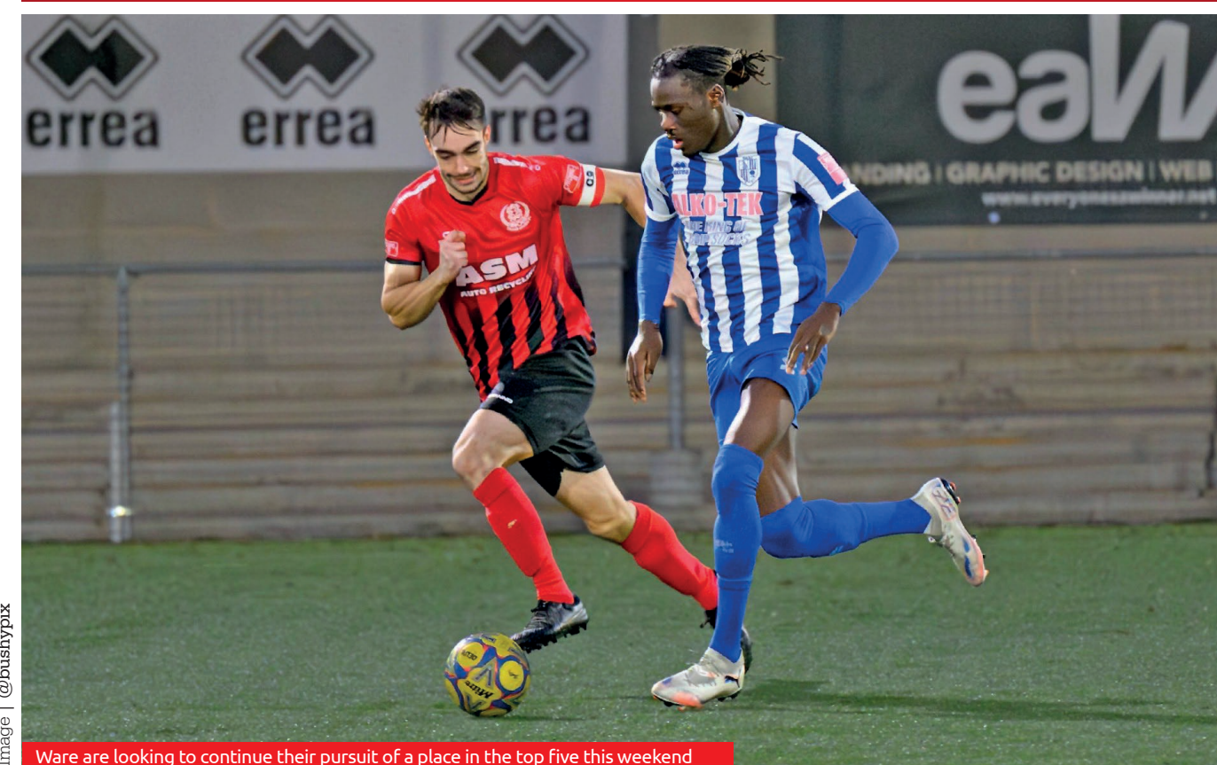
Ware are looking to continue their pursuit of a place in the top five this weekend

The pursuit of leaders, Leighton Town, continues with Hertford Town heading into the festive period in good form having chalked up an impressive 5-0 away win at Biggleswade Town in their last outing. This weekend they go to Northwood.